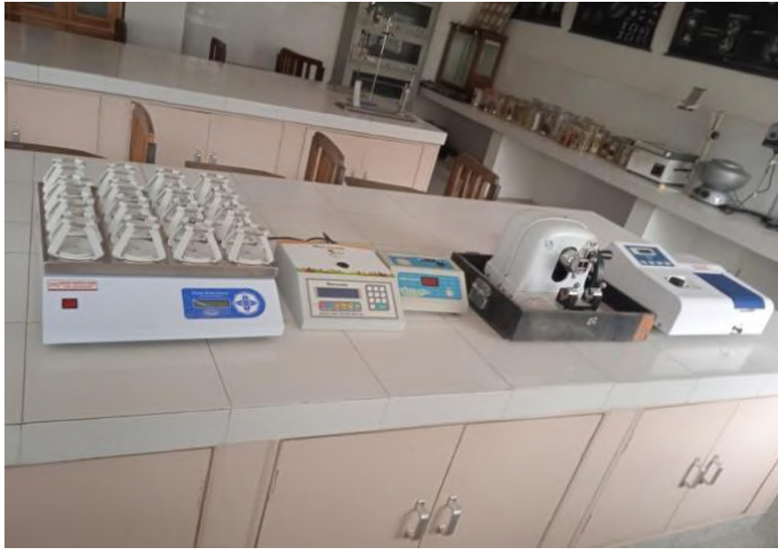
Apparatus (Botany department)