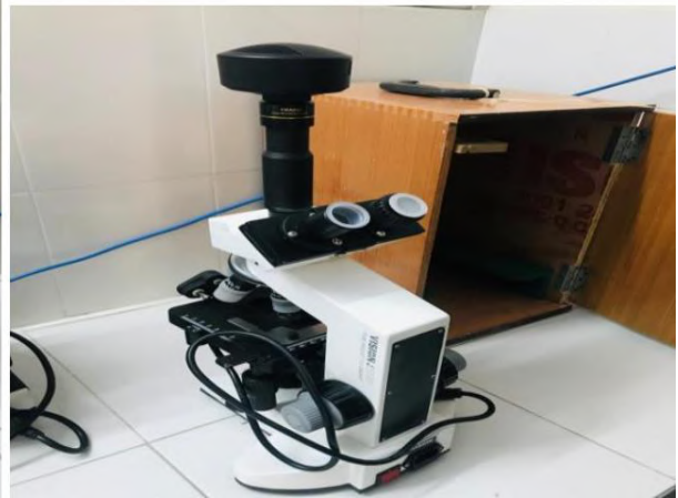
Apparatus (Zoology Department)