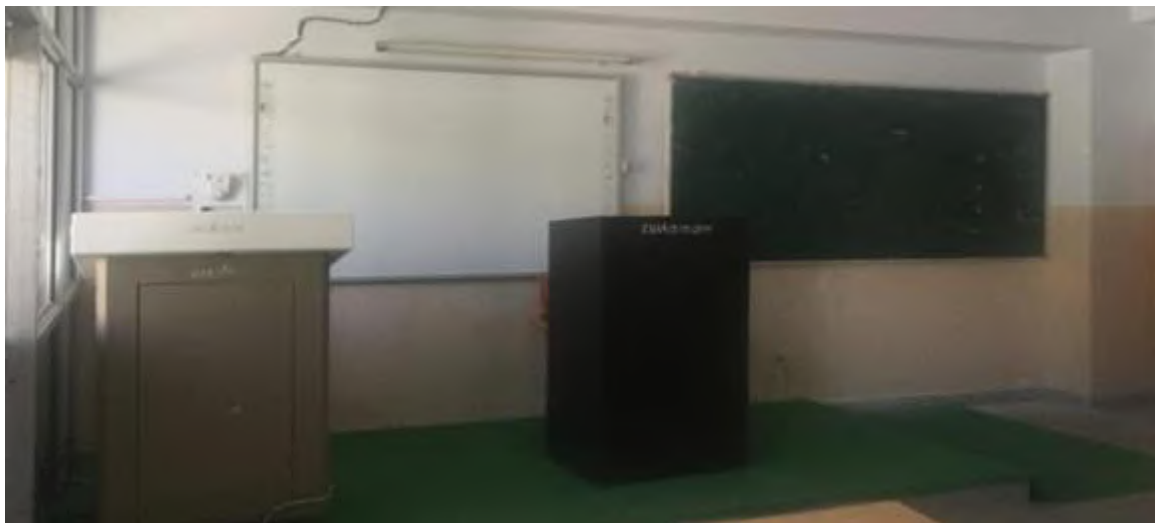
Digital Teaching System (Chemistry Department)