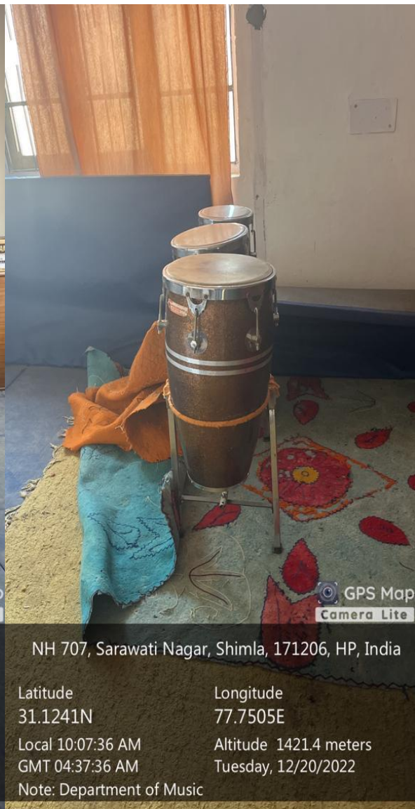
Musical instruments at Music Department