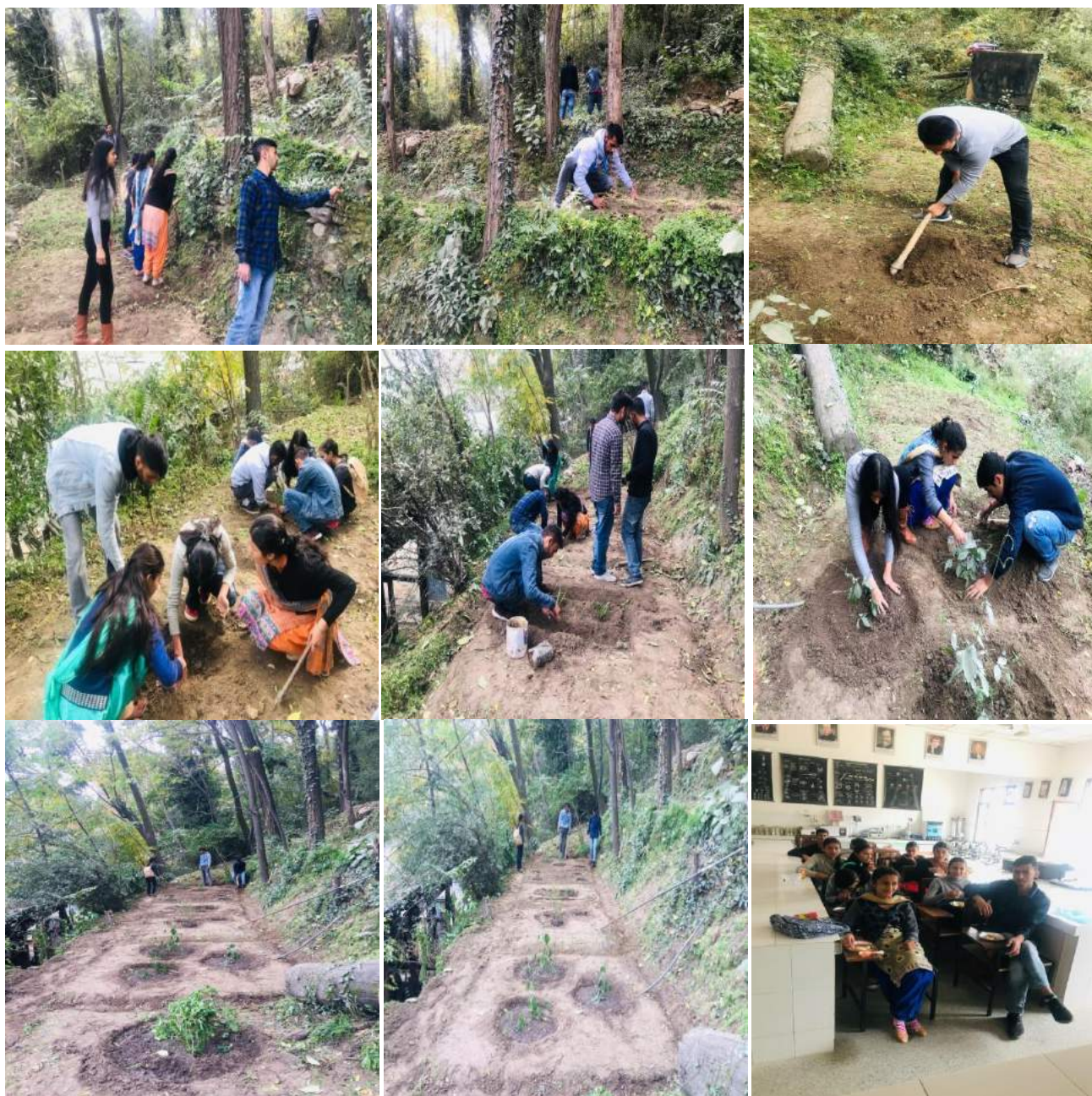
Fig.4 Development of Herbal Garden

To continue with the previous task of developing the Herbal Garden in the College Premises with reference to HIMCOSTE Letter Number STL(F7)10/12 Plan Project E-E-026 again the students and teachers of the Eco Club Unit were gathered at the site. Students and teachers were asked to bring some medicinal plants/ ornamental plants one day before, so on 02.11.19 these plants were planted by the students. Students were grouped in various groups. Each plant was allotted to a particular group to plant and look after that plant in future. Refreshment was also distributed among the students.