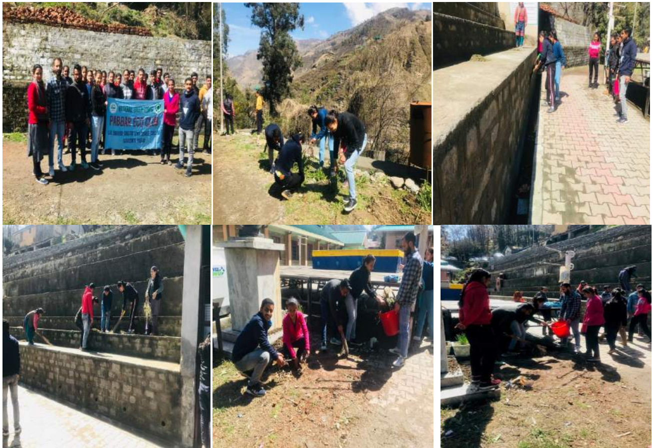
Fig. 5 Cleanliness Drive

It was a need of hour and yes that's why the Eco Club unit of the college takes this initiative of cleanliness every year to spread awareness among the students and teachers even the surrounding people to think, initiate and implement this. It should be our duty to take one step ahead against the Swachhta Abhiyan and make our region, our state, our country a disease free, pollution free and completely developed country. With this campaign, this year also the members of Eco Club took a pledge to clean our college campus and surrounding areas. We started at 10:30 am with the teachers and students from NCC. We took brooms and garbage bags in our hands to clean and pick up the plastics found in the campus and surrounding areas. We cleaned every nook and corner of the college including corridors, ground, parking area, canteen area etc. After doing the same for about four hours, we all gathered in the college hall. There refreshment was distributed among the students and the teachers. Eco Club members and some of the students volunteered to give speech on cleanliness campaign and harmful effects of plastics. Everyone was felt so contented in beautifying their own campus. We all took oath not to use plastics, disposables, and to keep our surroundings clean and also motivate others to do the same. The purpose of this campaign was found fruitful.