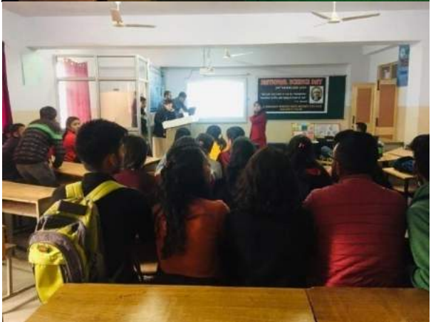
Fig.6 National Science Day