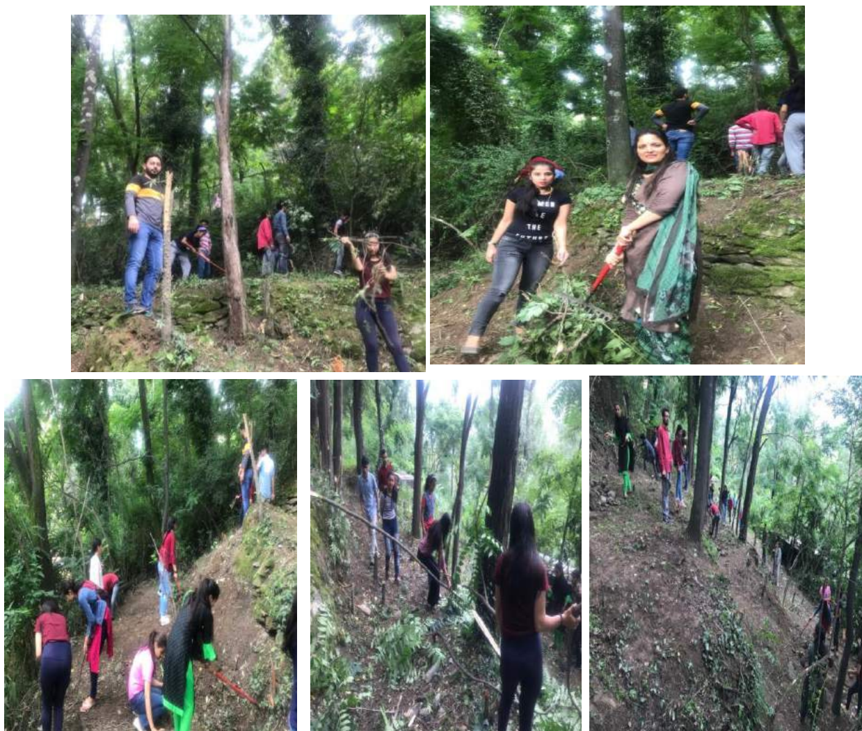
Fig.3 Development of Herbal Garden

A laborer was hired then to level the site as it was difficult for the students to level the site without proper tools and implements.